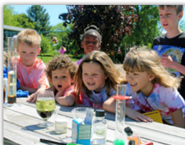
Science Fun Day