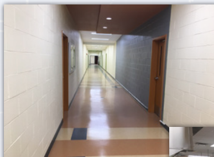
WEMOCO corridors with new flooring and paint

School bus drivers are raving about the new bus loop at ESC. The loop and new traffic flow on campus have improved safety and security. Work will continue in buildings and outdoor locations on the campus through the school year.