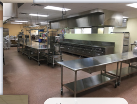
New equipment in Culinary Arts kitchen