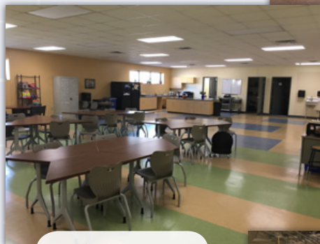
Food Services theory classroom