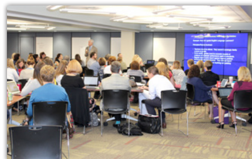
Rick Wormeli addressing the crowd of teachers and school administrators

The Monroe 2–Orleans BOCES Office of CIPD works directly with component school districts to develop offerings that align district initiatives. In partnership with our districts, it supports state and district reforms by contracting with nationally-recognized authors and presenters to provide workshops. Follow-up sessions and coaching to assist with implementation are also available.