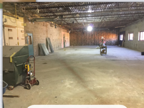
Demolition work in a room that will be used for welding